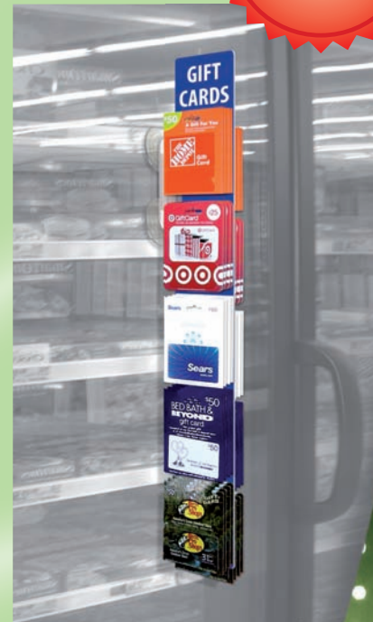
Glass Flex Panel Bracket