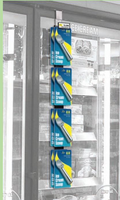
Cooler Door Bracket PowerStrip®