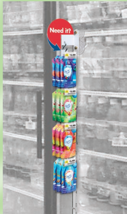
Glass SwingStrip® Bracket