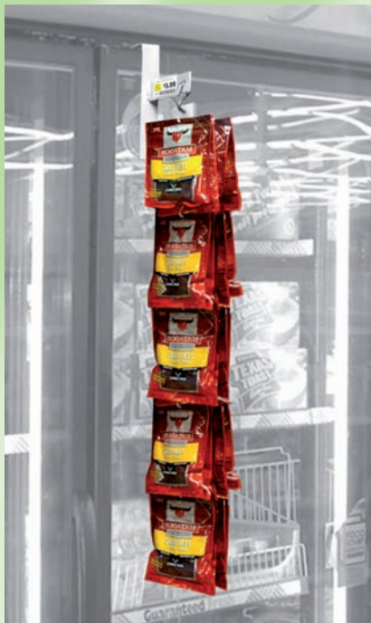
Heavy Duty Glass SwingStrip® Bracket